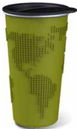
Item No.: MS119336