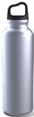
Item No.: MS2311