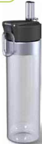
Item No.: MS6652B